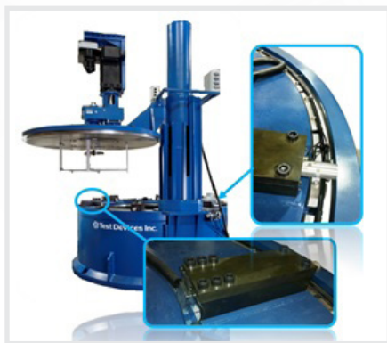
Figure 6: An example of robust lid retention mechanism

2. Strong Radial Containment. The containment should be designed to absorb kinetic energy of the burst fragment without having any of the pieces escaping outside of the spin pit. To safely dissipate the large amount of rotational kinetic energy, the containment ring must be free to rotate with respect to the vacuum chamber as a bursting rotor transfers its angular momentum to the liner during a burst. Spectacular accidents have occurred when the burst liner was constrained from rotation and the bursting rotor had enough energy to tear the spin pit from its mountings and cartwheel it around the room.