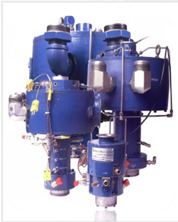
Figure 2: An example of modern high-speed drive unit with high performance spindle vibration damper system.

Destruction of good rotors by bad spin tests has been a serious problem since the first spin test was conducted more than 50 years ago. The original spin drive was brilliantly conceived and manufactured in a matter of weeks, to solve a serious problem for the military. Unfortunately though, few significant improvements to the process were made for nearly forty years afterward, and untold millions of dollars have been wasted as a result. The problems are caused by the inherent weakness of traditional spin test spindles and the inadequate performance of the vibration dampers intended to control the various resonant vibration modes of the spindle. These dampers behave unpredictably and cause the failure of the drive spindle and destruction of the test rotor. In one notable case, spindle failure destroyed half of all the rotors tested in a production operation. In another case it proved impossible to conduct a low cycle fatigue test on a critical jet engine rotor because the test assembly was always destroyed by spindle failure within a few hundred cycles of beginning the test.